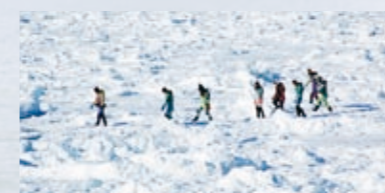
Drift ice walk

The walkways at Shiretoko Goko Lakes had problems including such examples as they were often closed on account of the frequent appearance of brown bears and the negative impact on vegetation resulting from visitor congestion. In order to resolve these issues, an elevated boardwalk that could be safely walked without the danger of coming into contact with brown bears was installed in 2011. In the same year, regulated utilization system was adopted pursuant to the Natural Parks Law. Visitors are required to apply for permission to go to the aboveground walkways during congested periods. Through these efforts, the impact on vegetation is reduced while also natural landscapes and biodiversity are maintained.