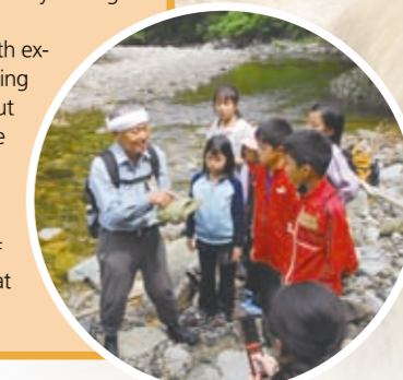
Learning wisdom of Matagi

With the programs, the children go out into nature together with experts of the rivers and mountains who have actually lived by receiving the bounty of nature in Shirakami-Sanchi. The kids hear talks about the traditional dietary culture and hunting from Matagi , Japanese traditional game hunter, and are taught knowledge on fishing from river fishermen. Programs are also held for children to learn about the wonders of nature together with rangers from the Ministry of the Environment through forest patrols and surveys of living creatures. Environmental education is promoted in a way that uses Shirakami-Sanchi as living teaching materials.